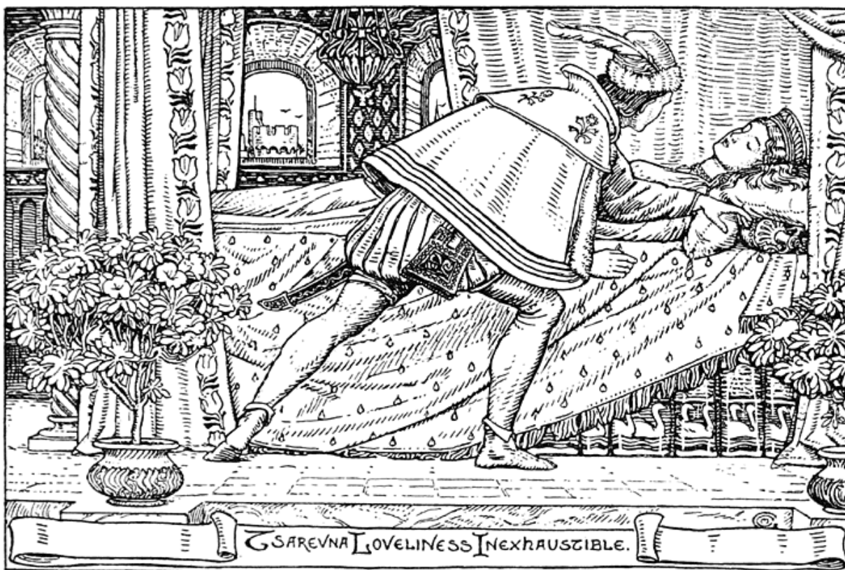
Tsarevna Loveliness Inexhaustible.

father's head and our own heads also? 'Twill be much better to return home alive and well, and wait for fine weather by the sea." And they turned back; and when they were a twenty-four hours' journey from home, they resolved to rest in the fields; and they spread their tents, with the golden tent-poles, let their horses out to graze, and said: "Here we'll stop and await our brother, and while away the time in idleness."