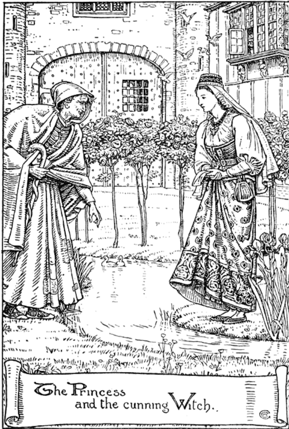
The Princess and the cunning Witch.

Meanwhile the poor duck, dwelling in the bright stream, laid eggs and hatched its young; two were fair, but the third was still-born, and her babies grew up into little