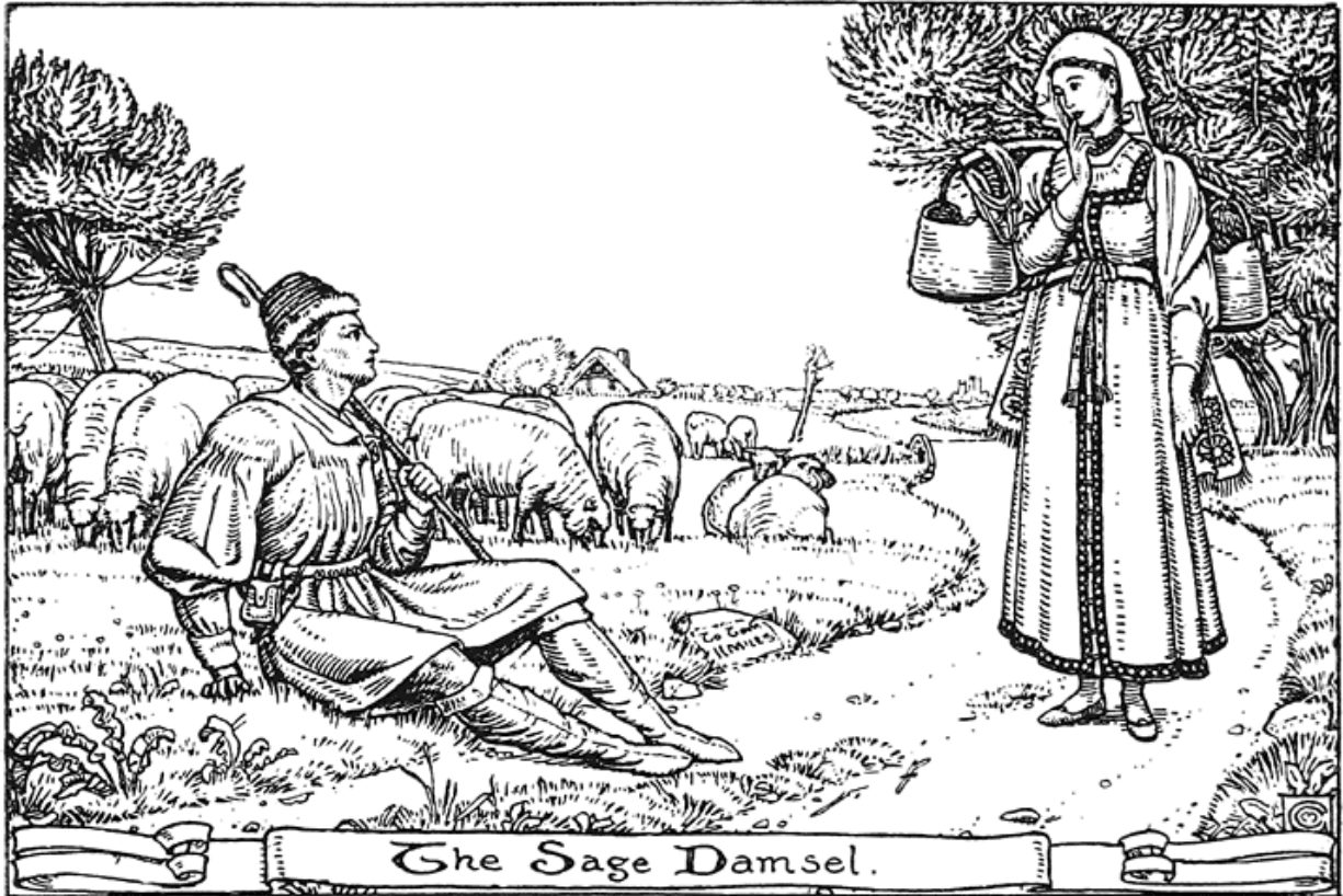
The Sage Damsel.

So the nephew went to town to sell the uncle's corn, and on the way he met a rich miller.—“Why art thou off to town?” said the miller.—“I am going to the bazaar to sell my uncle's corn.”—“Then we'll go to town together.”—So they went along the road together, the miller in his gig with his plump brown horse, and the orphan in his little cart with his thin gray mare. They encamped side by side in the open field to pass the night there, took out the horses, and themselves lay down to sleep. And it happened that self-same night the gray mare dropped a foal. The rich miller woke earlier than the orphan, saw the foal, and drove him beneath his gig. When the orphan awoke a hot dispute arose between them. The orphan said: “It is my foal, because my mare dropped it.” The covetous miller said: “No, 'tis mine, because thy mare dropped it beneath my gig.” They wrangled and wrangled till they resolved to go to law about it, and when