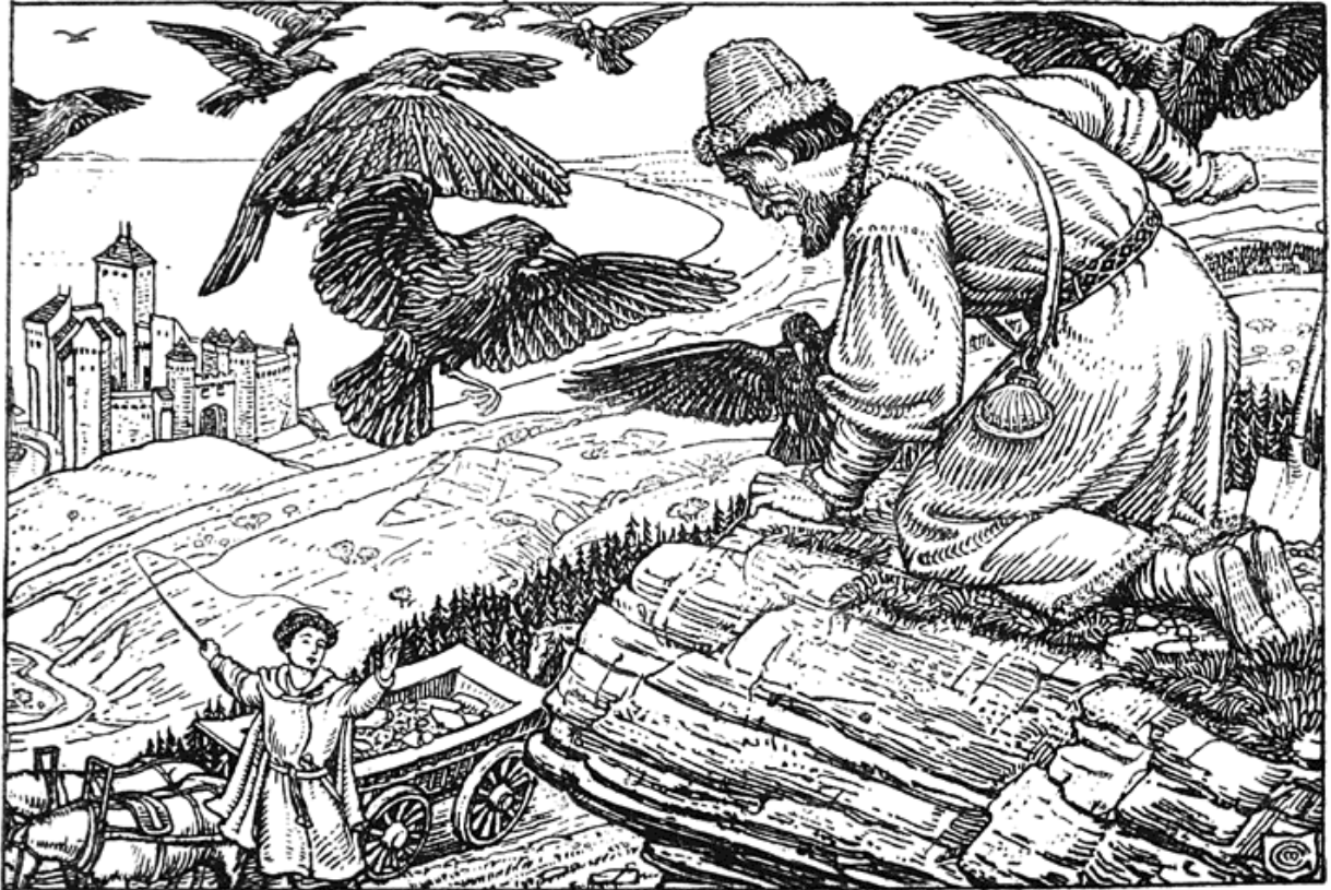
The Golden Mountain.